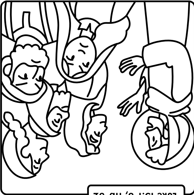
Luke 15:1-3, 11b-32

1. Jesus was teaching, and lots of people were listening. The people listening were considered sinners and weren't well-liked by their community. That didn't matter to Jesus.